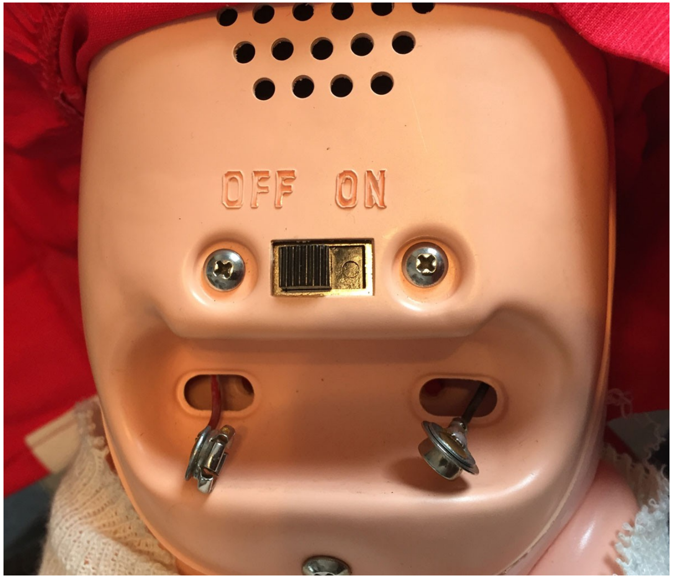
Here's the business part of the doll. Her stomach contains a speaker and on/off switch. No tuning, as you tune the phonograph to match the doll. Her abdomen is molded to let a round 9 volt battery snap into place and the two battery terminals snap onto the battery ends.