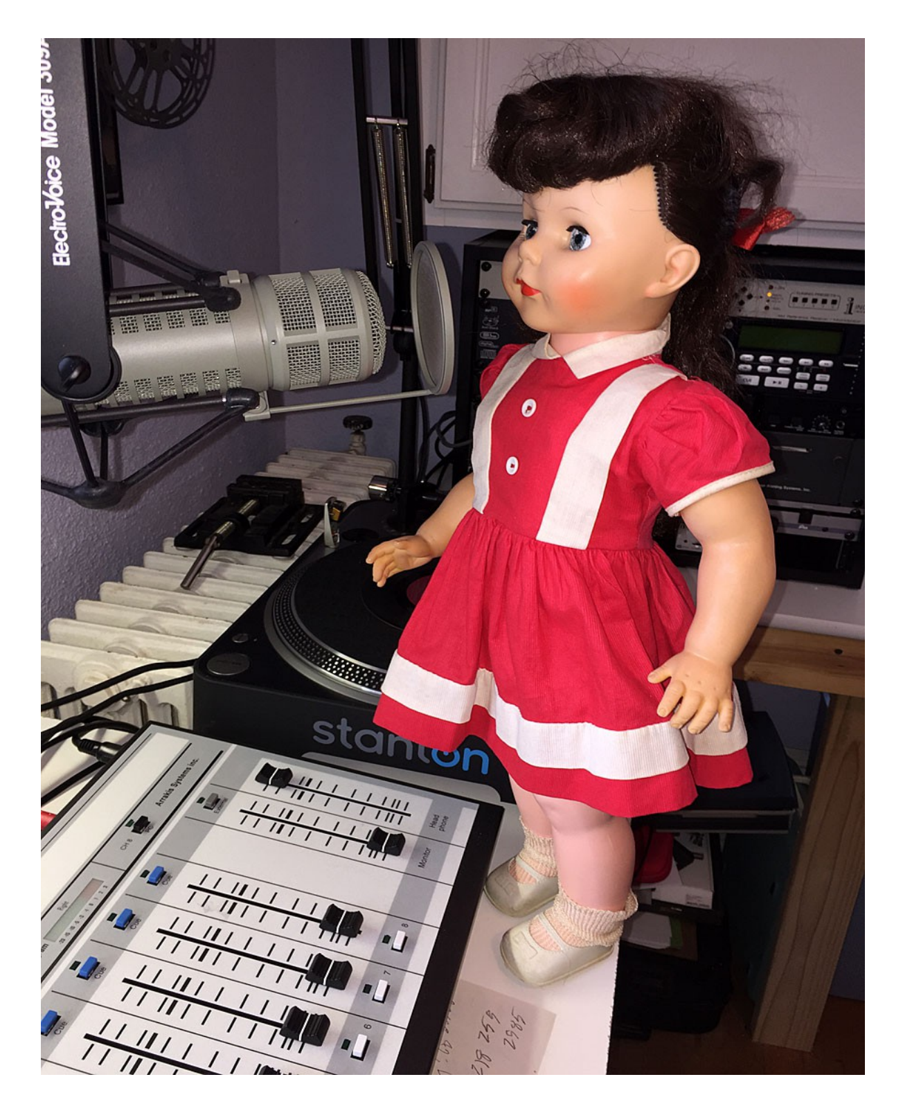
Her she is on the air at KEBS Radio