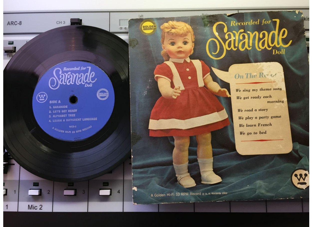
She talks and waits for you to answer.

The elusive original record with sleeve. The owner gets to play all the activities with Seranade