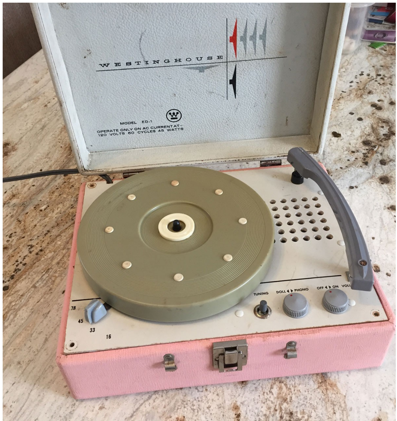
It's just a typical kids 4 speed record player. With a built in transmitter.